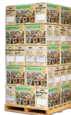
Pallet / Truckspace